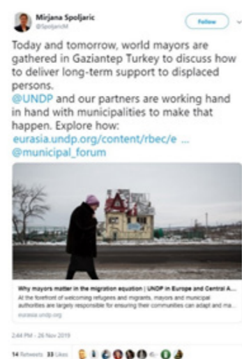
Tweet by Ms. Mirjana Spoljaric: https://twitter.com/SpoljaricM/status/1199458868612534273