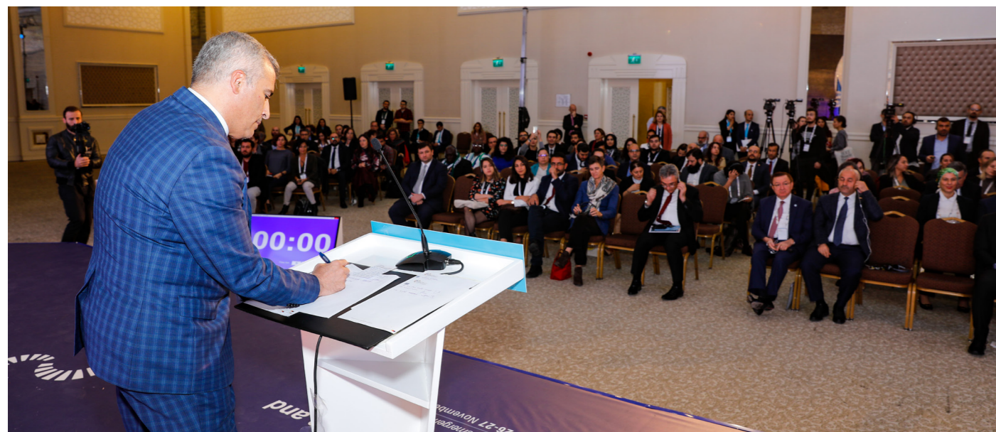
Latif Karadag, Deputy Mayor of Gaziantep Municipality, closed the forum and made the final signature to the Gaziantep Declaration.